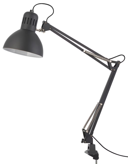
Figure 2: Inspiration for the robotic arm